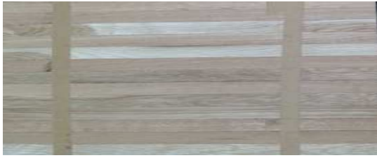
Rovere Francese Industriale - Industrial French Oak