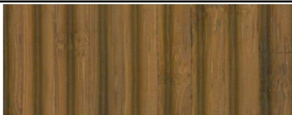
BAMBOO DECKING - TEAK