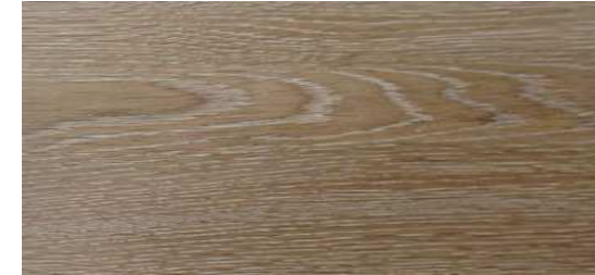
ROVERE RUSSO ORIZZONTE SMOKED