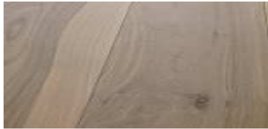
NOCE EU NATURALE / EU WALNUT NATURAL