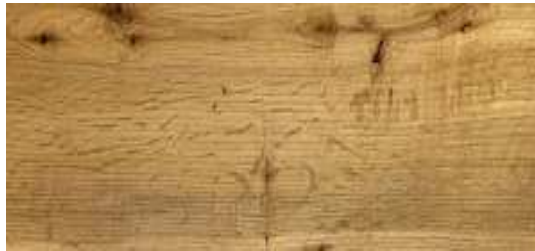
ROVERE RUSSO spazzolato/piallato a mano, 20% tasselli in legno