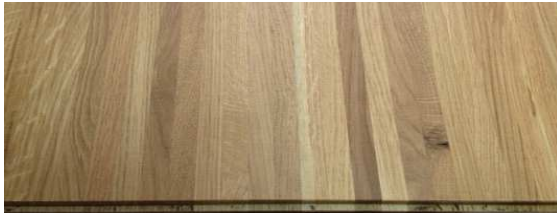
ROVERE "PIATRA" / INDUSTRIAL OAK TG