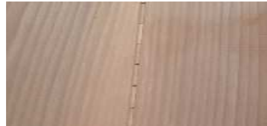
NOCE EU EVAPORATO / STEAMED EU WALNUT