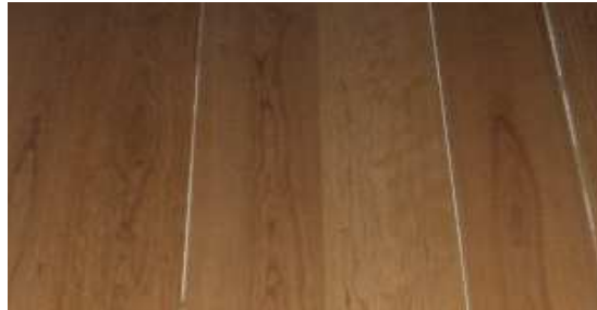
CILIEGIO AMERICANO - AMERICAN CHERRY