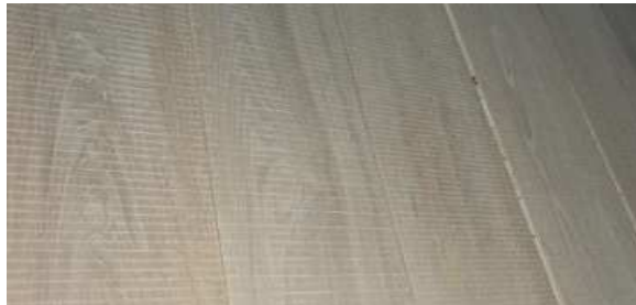
ROVERE seghettato, non finito OAK sawn mark, unfinished