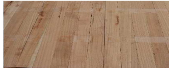
Ciliegio Americano industriale - Industrial Am. Cherry