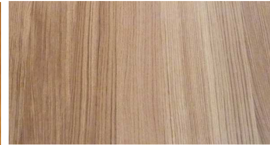
ROVERE / OAK