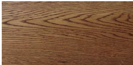
ROVERE RUSSO ORIZZONTE VIENNA