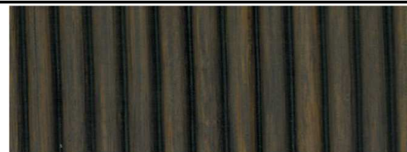
BAMBOO DECKING - WENGE'