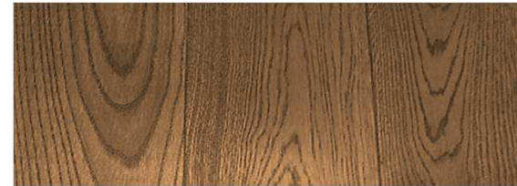
PHT INDONESIA TEAK with microbevel