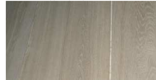
ROVERE AB grade, leggermente spazzolato OAK AB grade, light brushed